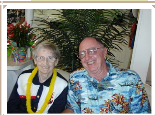
Nonna & Nonno (Grandma & Grandpa)